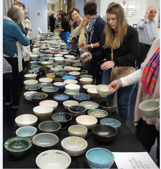
Empty Bowls 2018