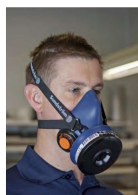
SR100 Half Face Respirator