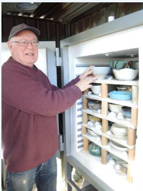
Opening the kiln

If you wish to sell pots at the event, leave them in the green workshed with prices and ID.