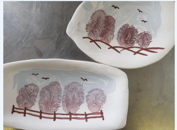
Pots by Eve Gellatly